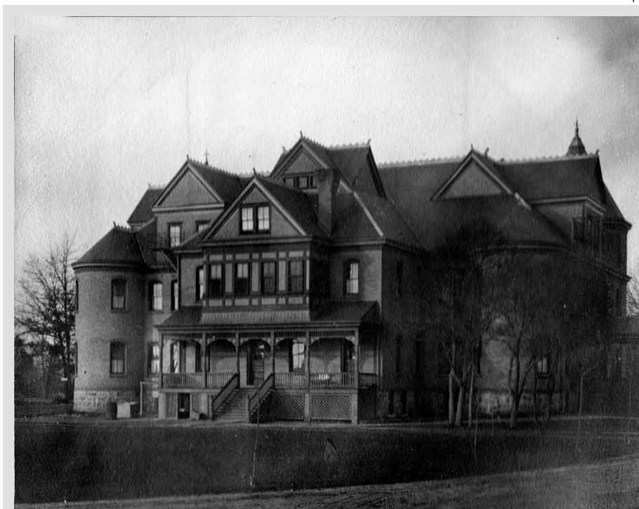
Figure 7.3. Maxham Cottage, Vineland Training School for Feeble-minded Children, Vineland, New Jersey.